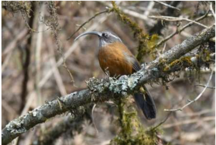
Slender-billed Scimitar-Babbler

Today we will bird along one of the most beautiful and peaceful roads in the world. Here we will work the warm broad-leaf forests at elevations from under 2,000 feet to 7,000 feet, enabling us to see a wonderful variety of birds. One of the highlights of this part of the tour is the impressive number of Golden Langurs. Some of the birds that we hope to find in this region include Crested Serpent-Eagle; Asian Emerald Dove; Pin-tailed Green Pigeon; up to seven species of cuckoo; Red-headed Trogon; the sensational Great Hornbill; White-browed and