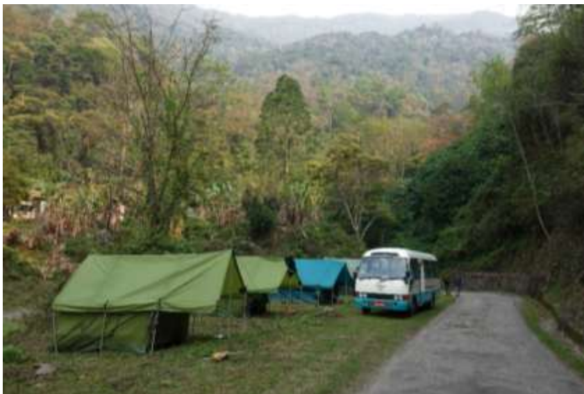
A typical campsite in Bhutan

The following is a selection of just some of the birds recorded in this area: Rufous-throated Partridge (heard often, rarely seen); Black Eagle; Speckled Wood-Pigeon; Rufous-necked Hornbill; Ward's Trogon; Collared Owlet; Golden-throated and Blue-throated barbets; Bay Woodpecker; Gray-chinned Minivet; Black-headed and White-browed Shrike-babblers; Common Green-Magpie; Sultan and Yellow-cheeked tits; Sikkim Treecreeper; Striated Bulbul; Pygmy Cupwing; all three tesias; a great variety of warblers including Gray-hooded, White-spectacled, Gray-cheeked, Chestnut-crowned and Black-faced;