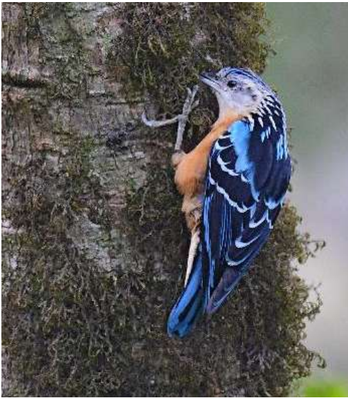
Beautiful Nuthatch from Zhemgang

April 7, Day 10: Drive to Darachu. After breakfast by the river in Punakha this morning, we will follow the course of the Puna Tsang Chu south towards Damphu – keeping an eye out where we can for the now highly elusive White-bellied Heron. As we approach Damphu, we will come to the White-bellied Heron Conservation Centre which we may have time to visit. This is indeed a very good stretch of river to look for this, one of the world's most endangered birds.