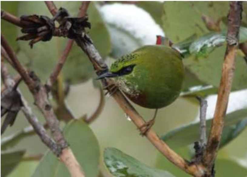
Fire-tailed Myzornis

April 12, Day 15: Trongsa and the Phobjika Valley. We climb through moist oak and broad-leaf forests before a sprinkling of tall conifers comes in at higher elevations. These exquisite mixed-forests are likely to be ablaze with flowering rhododendrons and magnolias. Just below the pass we will find ourselves in a wonderland of gnarled moss-covered trees with occasional open meadows where we are likely to spot our first yaks, perhaps grazing amidst blankets of colorful primulas. We'll make sample stops all along the way to search for the birds of the various zones and will undoubtedly be entranced by the scenes of the magnificent snow-capped Himalayan