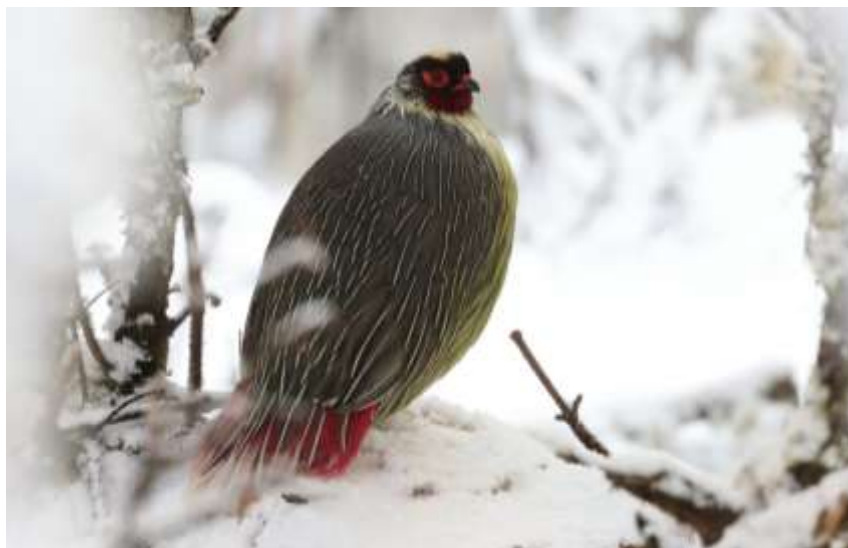
Blood Pheasant from Chele La

From our hotel we will wind upwards through blue pine and hemlock forests to a pass at over 13,000 feet. If we are lucky and the weather is clear, we may be treated to splendid views of both sacred Jomolhari and adjacent Jiju Drake, not to mention a 270-degree view of the Paro and Haa valleys and their surrounding hills. But this is not our main objective. Chele La (La means “Pass”) provides us with our best opportunity of the tour to ascend to the tree line and sub-alpine meadows and dwarf rhododendron scrub, and thus a good chance for several birds we are